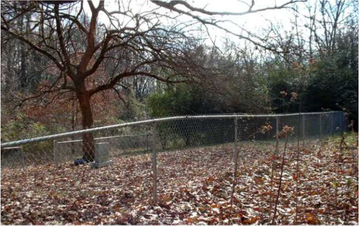
Madkin Cemetery, Redstone Arsenal, Madison Co. AL, 37-2.

(View from the northwest toward the southeast corner of the cemetery area.)