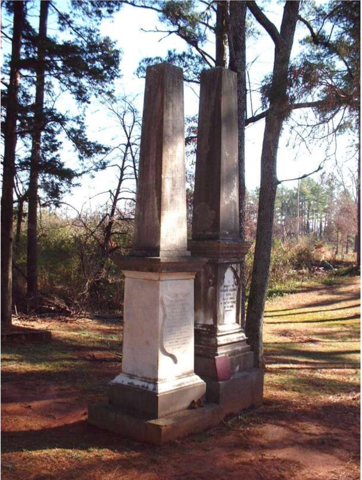
Holding family markers moved to old section Madison City Cem in 1984