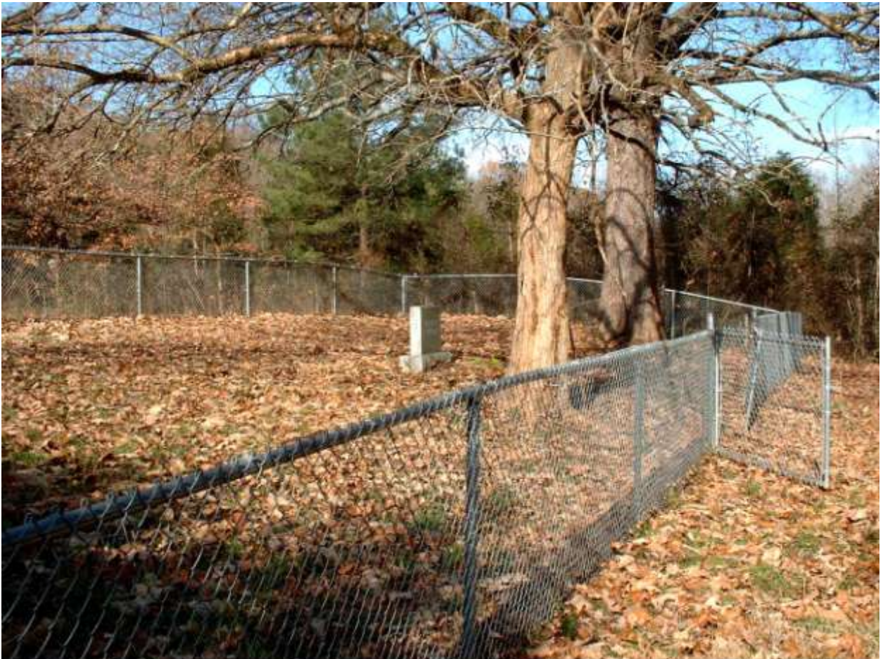
Madkin Cemetery, Redstone Arsenal, Madison Co. AL, 37-2.

Overviews of the Madkin Cemetery are provided below: