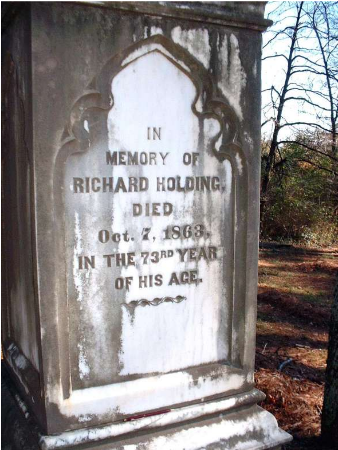
Remains and marker moved from original location at Madison County International Airport to old section Madison City Cemetery in 1984