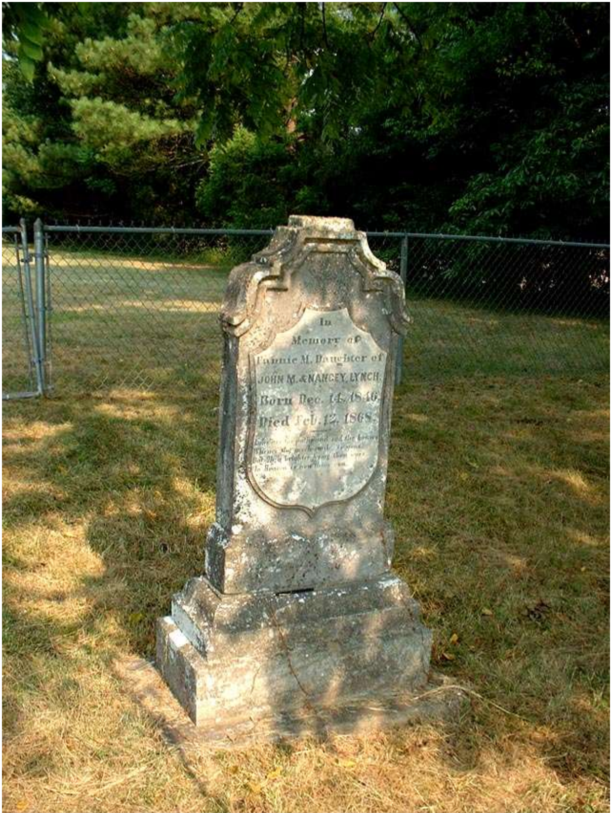
Lynch Cemetery, Redstone Arsenal, Madison Co., AL, July, 2002.