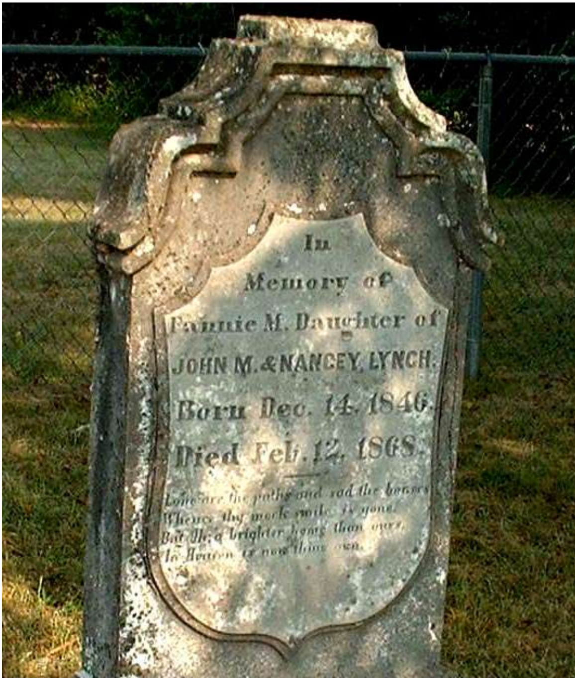
Lynch Cemetery, Redstone Arsenal, Madison Co., AL, July, 2002.