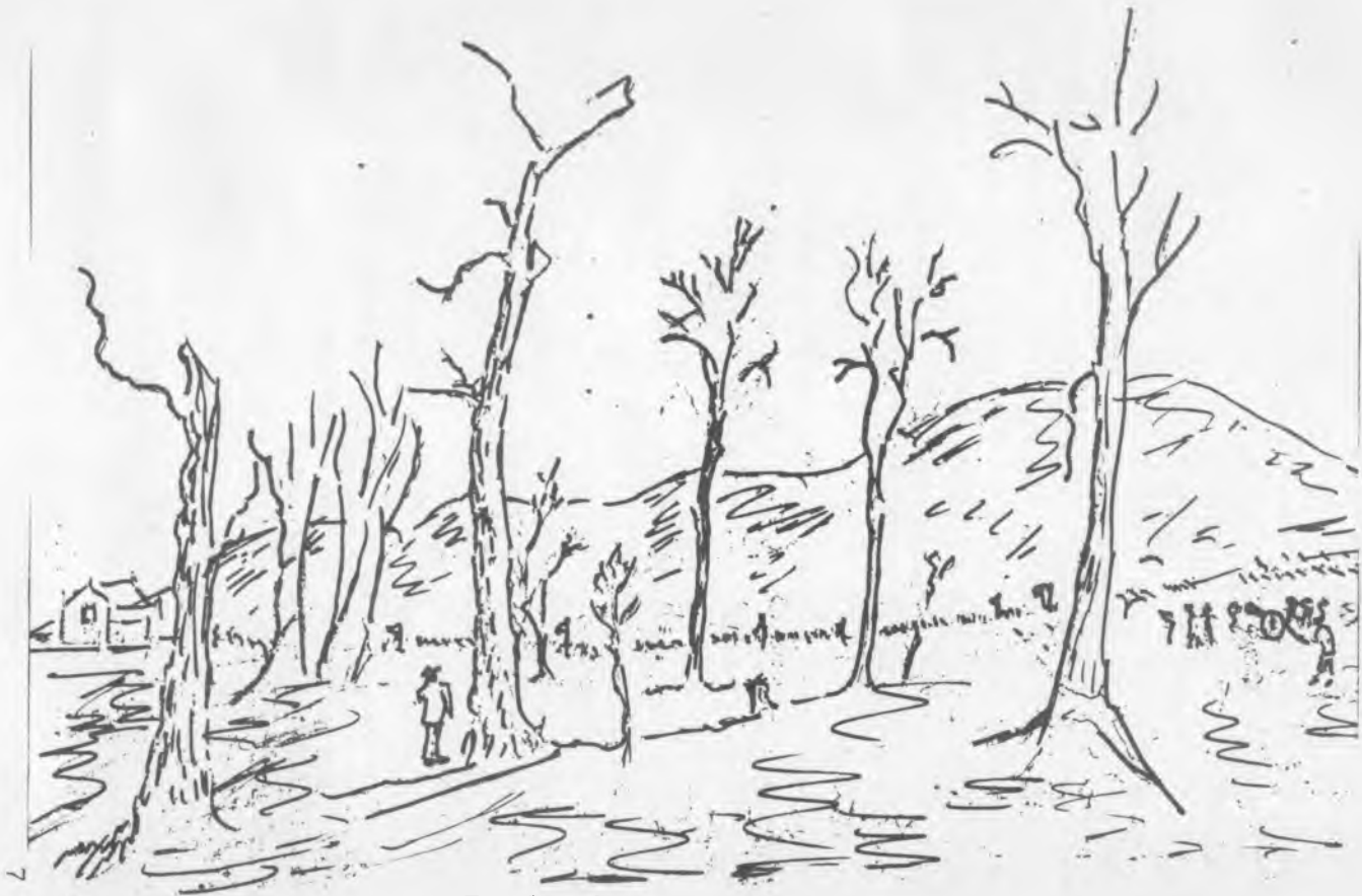
Battle of Nashville, afternoon of 2nd day (See page 8)