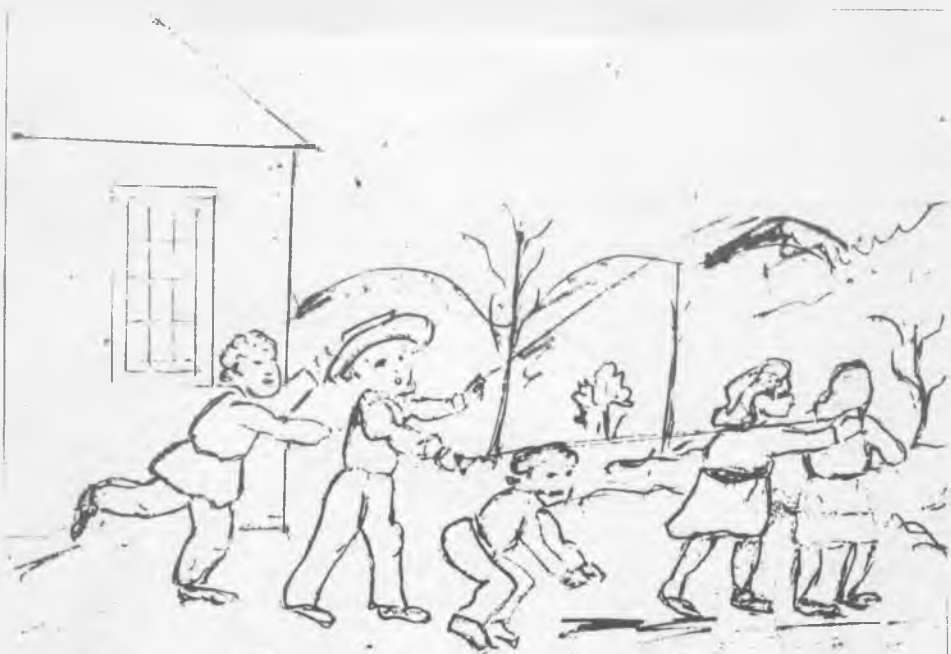
- Battle of Nashville: Children playing during the echelon charge. This scene and the one below are within the battlefield though not between the lines.