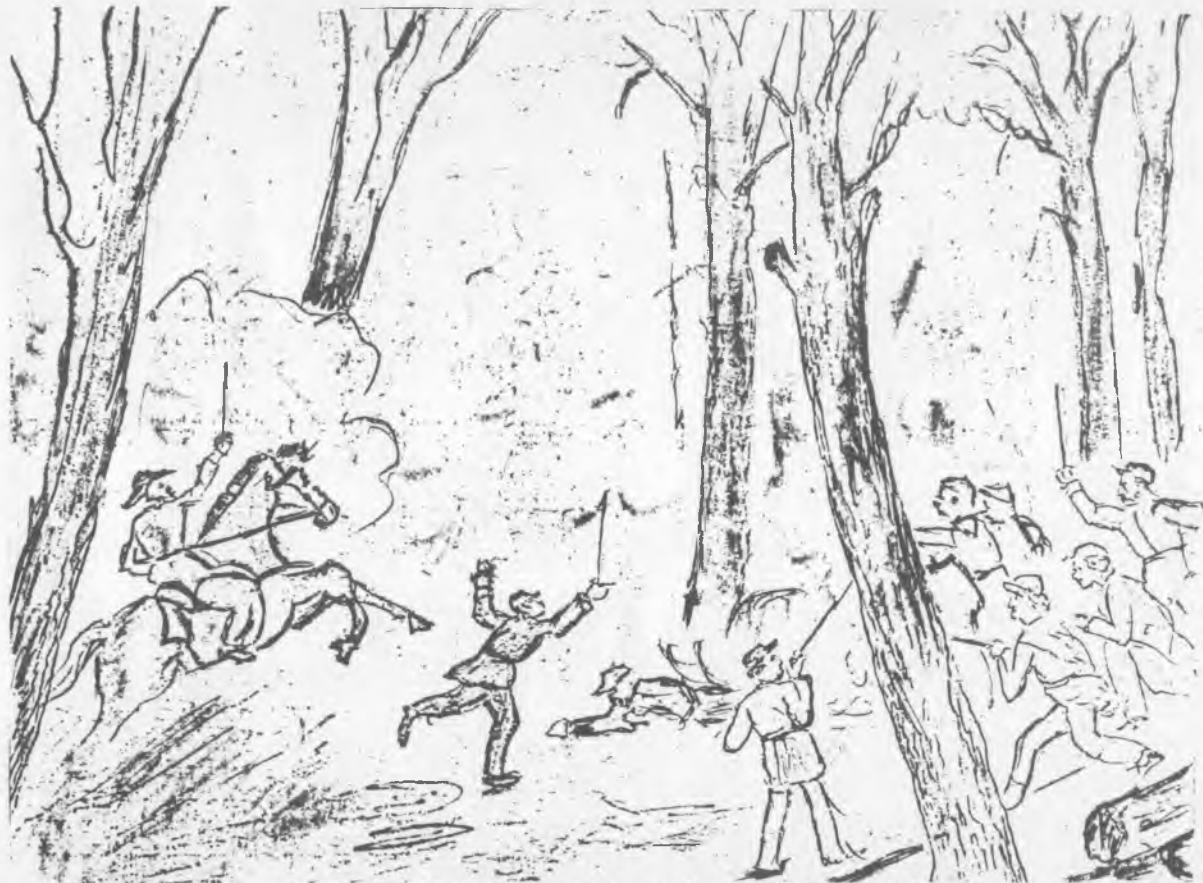
Fighting along the line of breastworks - Battle of Nashville